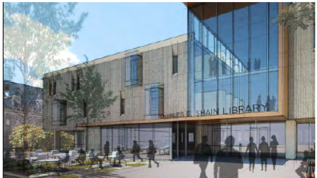
The transformation of the library entryway will allow more natural light into the building.