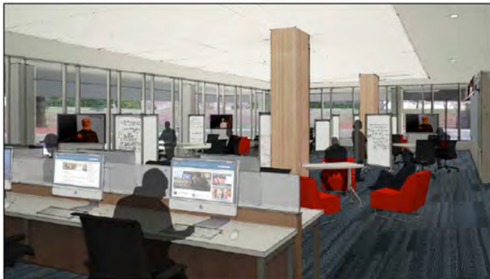
The renovated library will provide new spaces for students to utilize technology.

The impetus to renovate Shain Library actually began prior to 2000, when the Library Renovation and Extension Project committee was convened to seek ways not only to renovate Shain Library but to expand it as well. When funds for that initial effort fell