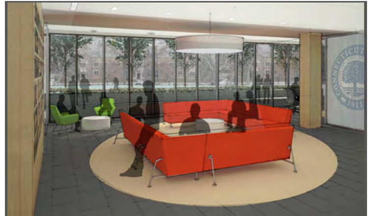
New furniture will help create more comfortable common areas.

short, conversations have taken place ever since with various consultants and architects about how to renovate the library. The project made its way onto the strategic plan that was developed short-