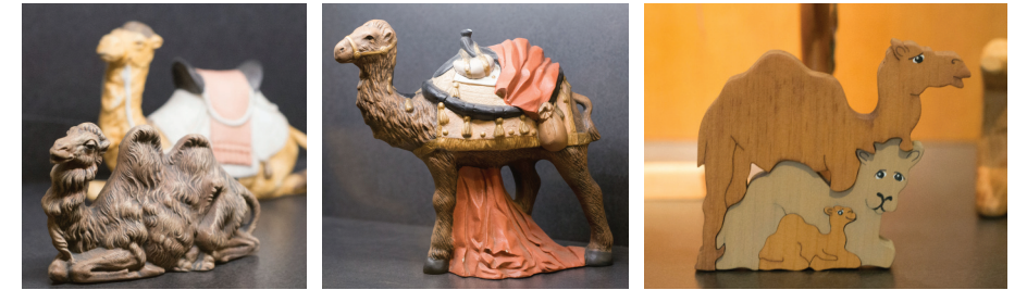
Camels of all shapes and sizes are now part of the collections at the Lear Center