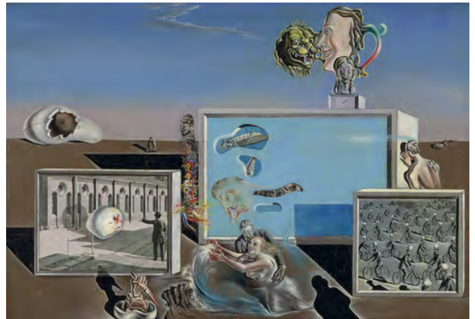
Illuminated Pleasures 1929, oil 23.8 x 34.7 cm