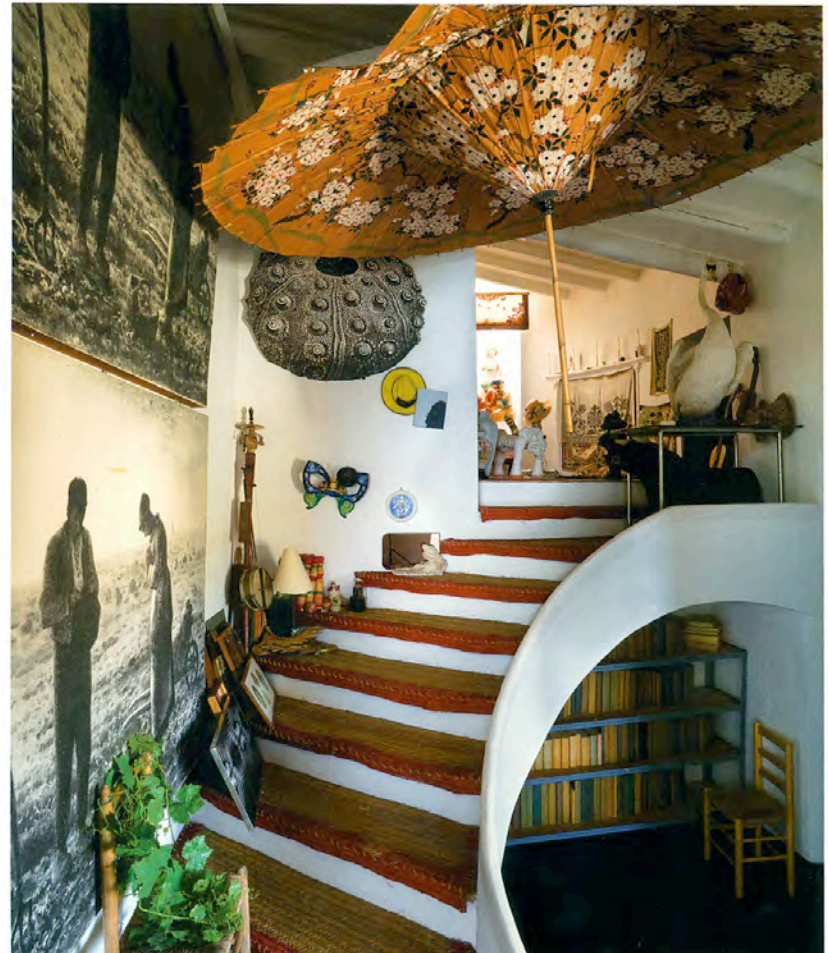
Stairwell leading to artist's studio