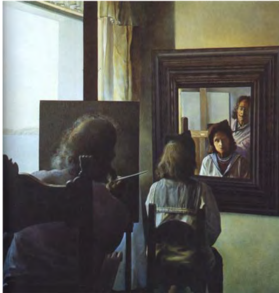
Dali seen from the back painting Gala from the back eternalized by six virtual corneas provisionally reflected by six real mirrors 1972