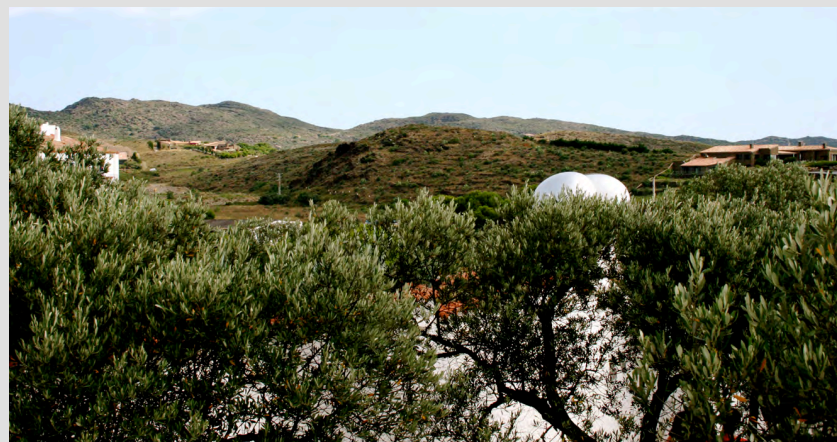
View of Cap de Creus from the terrace