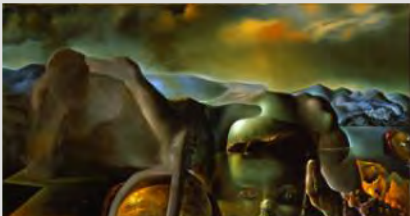
Enigma Sin Fin , oil 114.5 x 146.5 cm