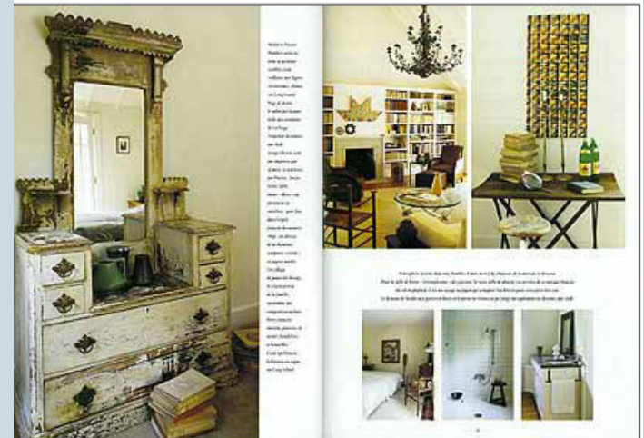
Cote Ouest Watermill