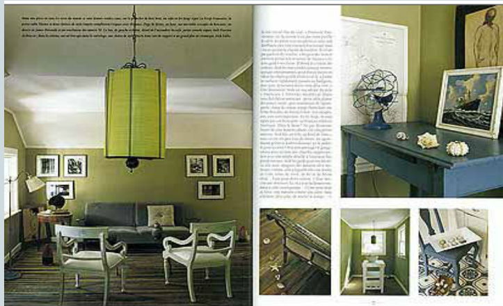
Cote Ouest Quogue