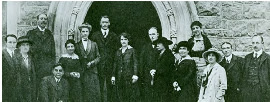
Connecticut College first faculty