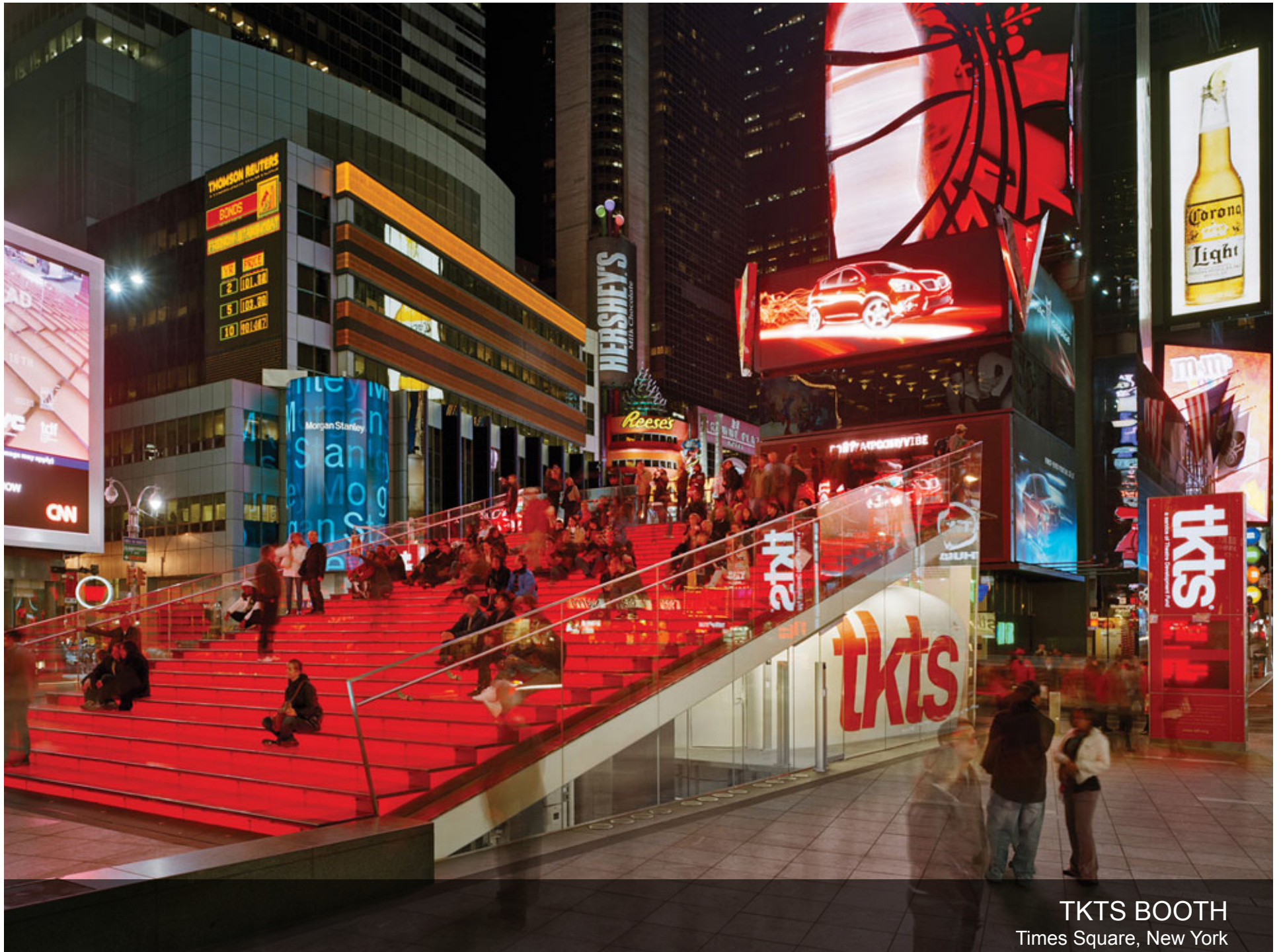
TKTS BOOTH Times Square, New York