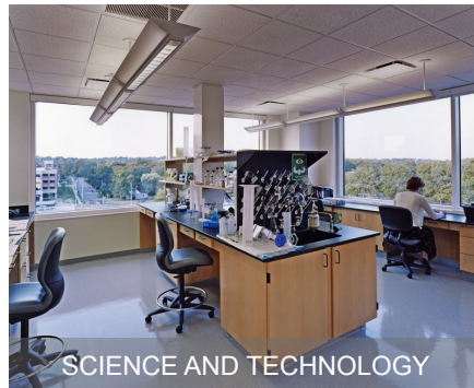
SCIENCE AND TECHNOLOGY