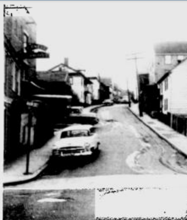
Shapley Street, New London, before urban renewal