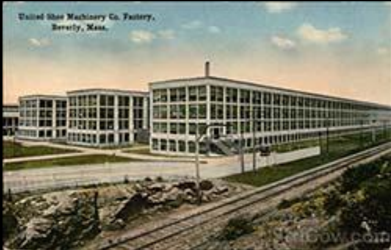
United Shoe Machinery Co. Factory, Beverly, Mass.