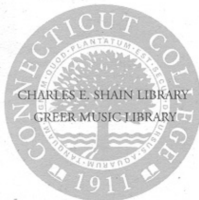
Book plate honoring Brian Rogers