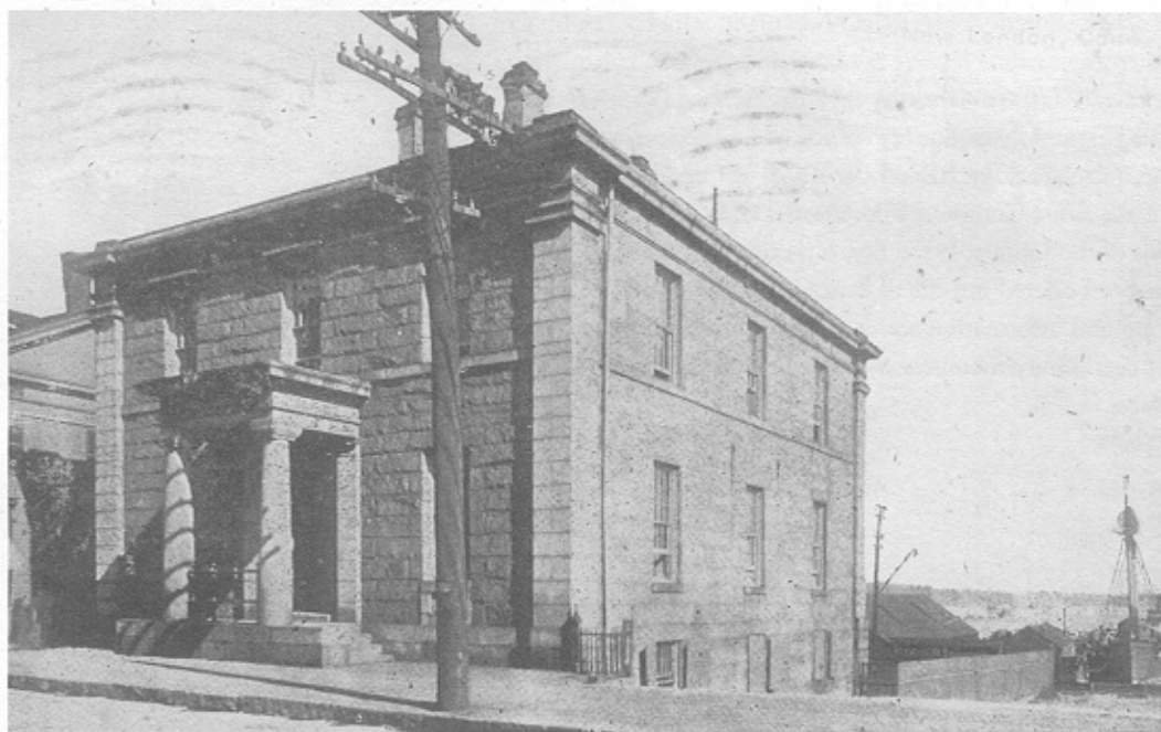
Postcard view of the U.S. Custom House and dock, New London, Connecticut, as it appeared around the turn of the century.

The Crawford letters are concerned with customs activities and the maintenance of the Morgan's Point Lighthouse and include several to or from Roger B. Taney, Attorney General and later Chief Justice of the Supreme Court. The fortunate discovery of the letters coincides with the New London Maritime Society's development of a library and archive relating to New London's maritime history. The Society was responsible for the restoration of the Custom House as a museum. Thus it was timely and appropriate that in July the one hundred and seventy-five letters were given to the Society where the originals will be preserved and high-quality photocopies will be made available for research purposes.