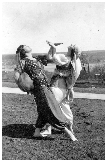
A performance of Aladdin from the twenties

I am always looking for donations from alumni, faculty, staff as well as the general public. Anything that provides historical insight into the life of Connecticut College, its students, faculty and staff is welcome. If you are interested in donating materials, volunteering, or if you'd just like to visit and have a look around, don't hesitate to contact me. The College Archives is open Monday through Friday, 9:30-12:30 and 1:30-5:00 (closes at 4:00 during the summer). Appointments are preferred, to allow time for research/visit preparation. My phone number is 439-2686 and email is nmsea@conncoll.edu.