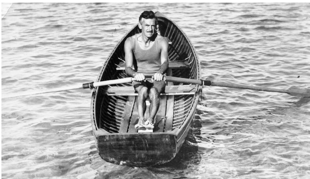
Eugene O'Neill in Bermuda (Sheaffer-O'Neill Collection)