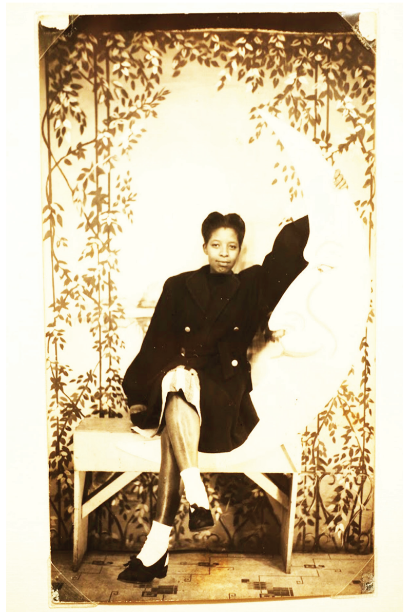
“African American girl on moon.” No location, ca. 1940s

4) Kidz Bop ( The New York Times Magazine )