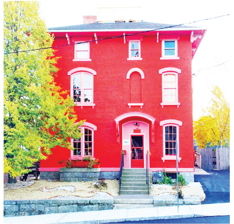
Red Square in New London

We move back into the hallway and I notice a blue pair of mannequin legs by the front door. He takes me past a mural for striking mushroom workers in Kennett Square, Pennsylvania, the mushroom capital of the U.S. The church bells ring outside. He points