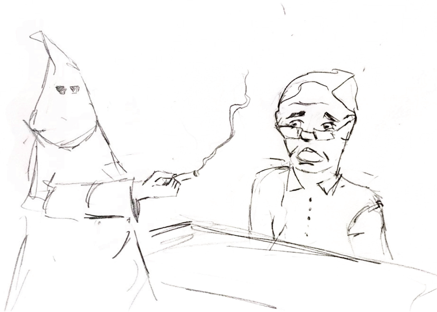
"I thought they were ok until I learned they smoked pot." Illustration by Roo Lerner

approximately 150,000 people could be left unemployed nationwide, and a nearly six billion dollar industry could be squashed. We would see a reversal in policies meant to keep urban youth, predominantly those of African American and Latino descent, out of prison for petty offences such as marijuana possession. But this is by no means the end of the story. This issue will most definitely continue to develop, and will likely include some sort of draconian legislation. But like just about everything with this new administration, it seems impossible to predict what's to come in the future. •