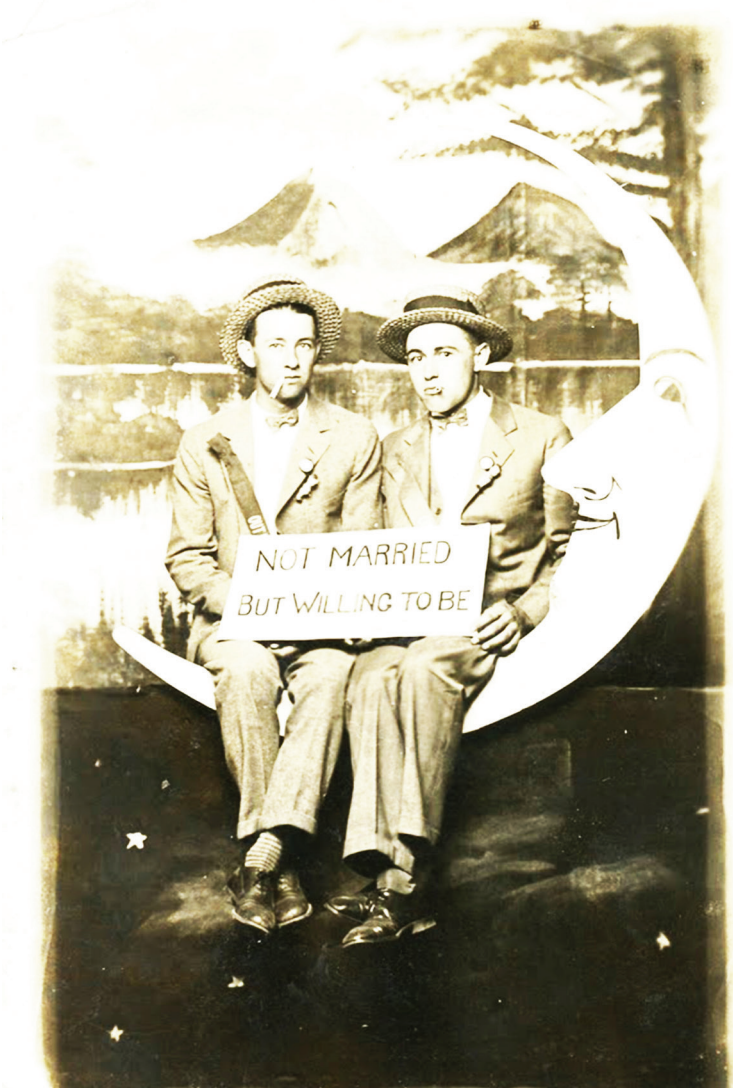
“Two men with sign.” No location, ca. 1907-15.