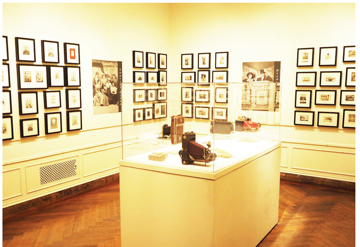
“It’s Only a Paper Moon” Exhibit