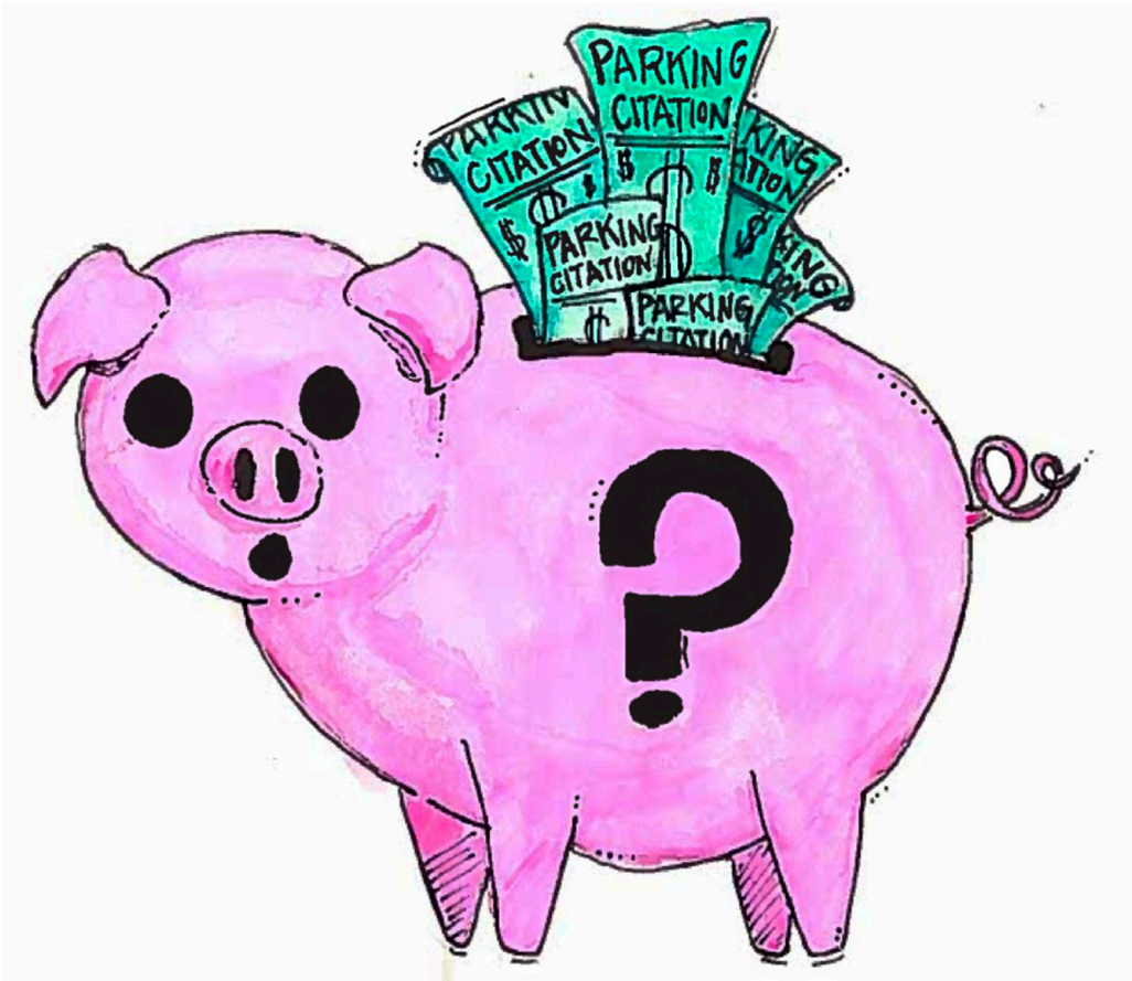
Where are the ticket proceeds going? Illustration by Amanda Chugg