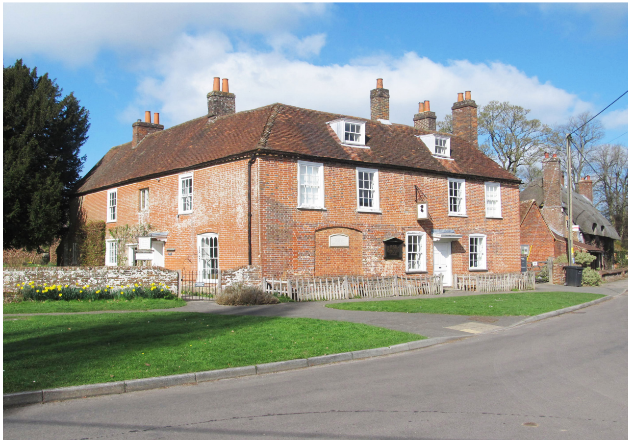
Jane Austen’s House Museum in Chawton, Hampshire, UK