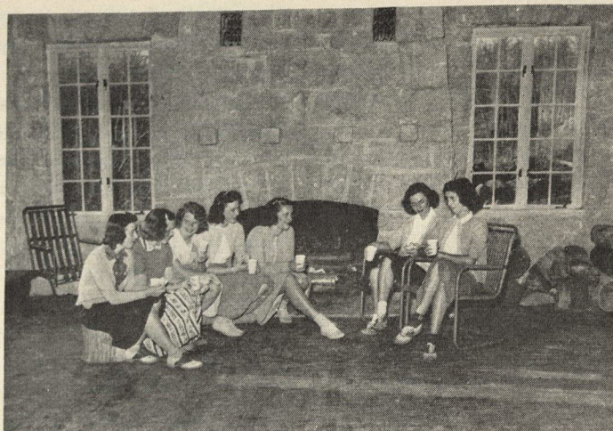
STUDENTS IN BUCK LODGE

Alumnæ are invited to attend convocation lectures, which will be given on the following dates: