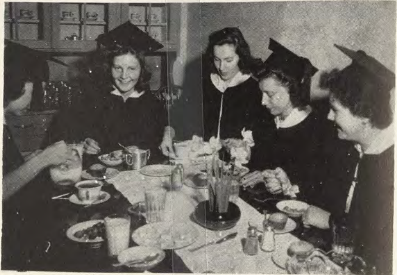
May Day Breakfast