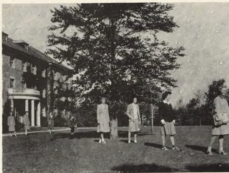
East View of Windham House

The sophomores sang their way to first place in Competitive Sing this year, and later in the evening presented their winning songs over the air in the last broadcast given this year by the Music Department under the Palmer radio project.