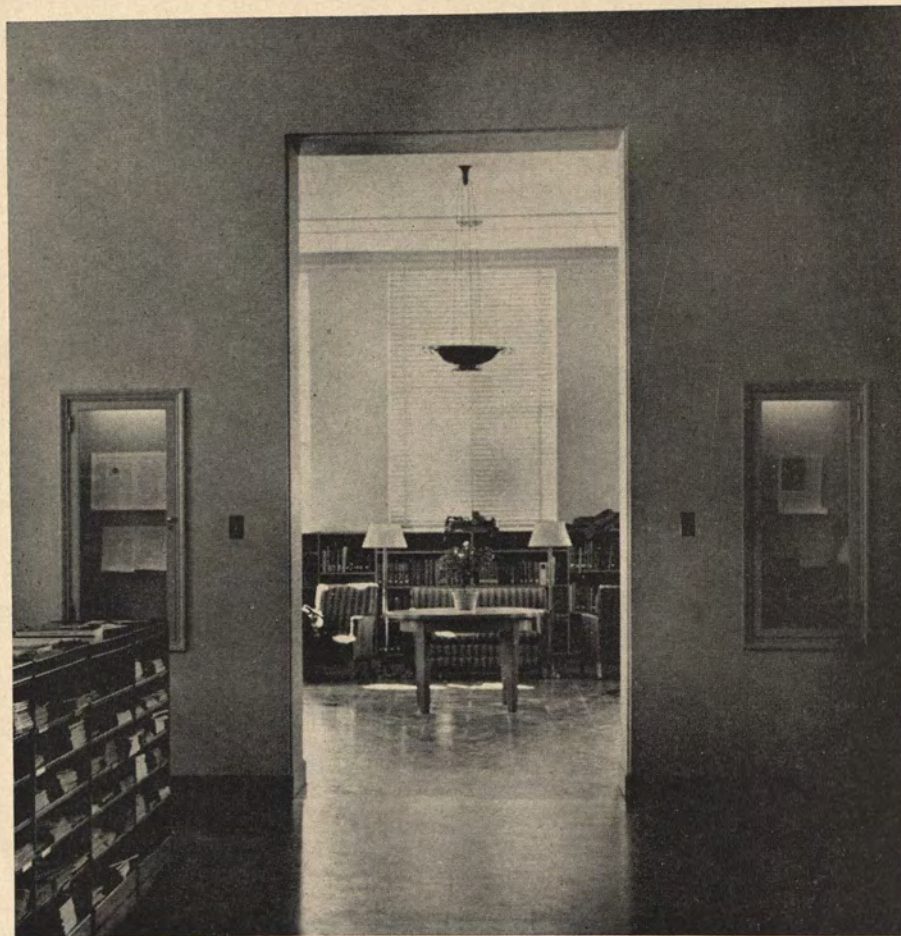
Reference Room on the West Side of Palmer Library