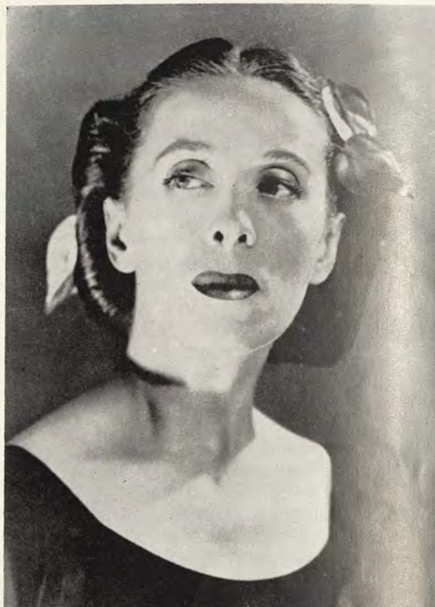
MARTHA GRAHAM To lecture on campus July 20