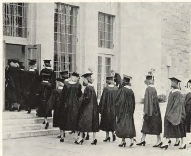
Commencement, Class of 1951

very strong question on the part of the teachers from all schools as to the desirability of the college board examinations from their standpoint. One had the impression they could throw courses out of gear. One teacher pointed out the physics examinations recently had selected topics which might or might not have been stressed in course. There was not a sufficiently wide choice. The chief difficulty with the biology examination was reported to be the excessive use of special terminology. There was also comment on trickiness in framing problems. This was presumed to be intentional, possibly for testing aptitude. The secondary