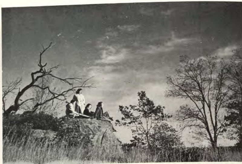
Picnic on campus boulders.