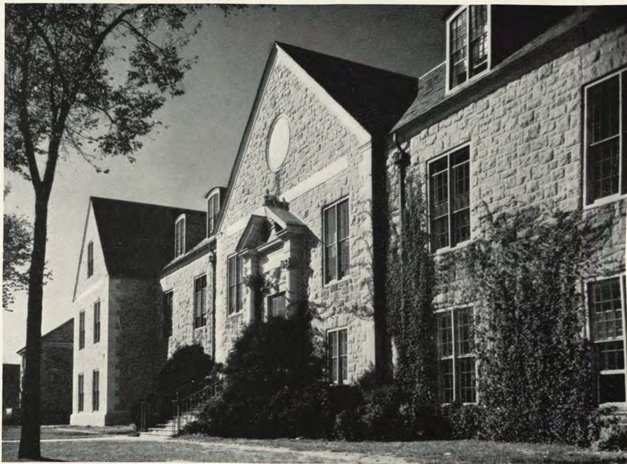
The first of the Georgian buildings, Palmer Library.