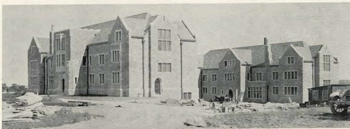
Plant and Blackstone in 1915

The architects did not attempt to produce a precise representation of early Gothic, but made organic modifications of traditional features of the style. Although they used casement windows with "Hood" panes imported from