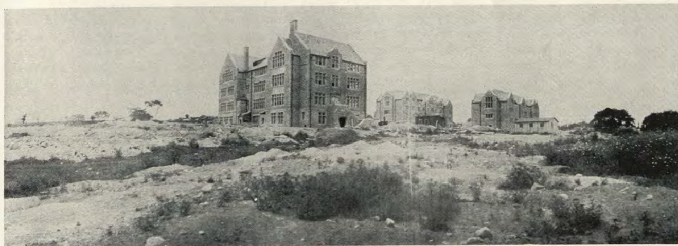
The first buildings, New London, Plant and Blackstone stood amid granite boulders and bitter winds.

Interestingly, the buildings of the college reflect certain major trends in American architecture. The most recent trend—a more complete acceptance of "extreme modern"—is represented in the design of both the interior and exterior of the new Infirmary. The most striking feature of the building, the way in which the west end appears to be suspended in mid-air, results from the fact that this end is cantilevered: a single masonry-covered pier supports two large steel girders in the side walls. According to Mr. Bernhard, a member of the architectural firm of Shreve, Lamb, and Harmon, architects who designed the building, the principal reason for cantilevering the Infirmary is to permit the service road to continue on under the building and thus provide a convenient service entrance on the basement floor.