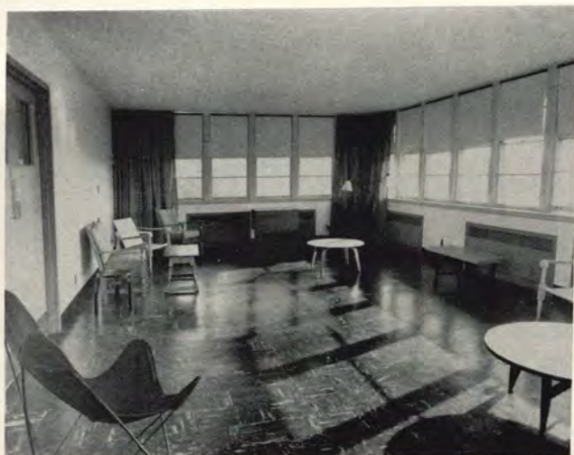
The solarium: bright draperies and Knoll chairs.

By taking advantage of the sloping ground of the site, the architects were able to make full use of basement rooms, of which the principal one is the kitchen, serving the entire building. On the floor above, all bedrooms have been placed on one side in order to permit south light to enter all the bedroom windows. An eight-foot copper louvre, which runs the length of the south side, serves as a permanent sunshade to eliminate excessive glare from the rooms. On the roof, a "penthouse apartment" for resident nurses is still under construction, and the roof may be used eventually as a sunbathing deck for students, if New London supplies its quota of sunshine.