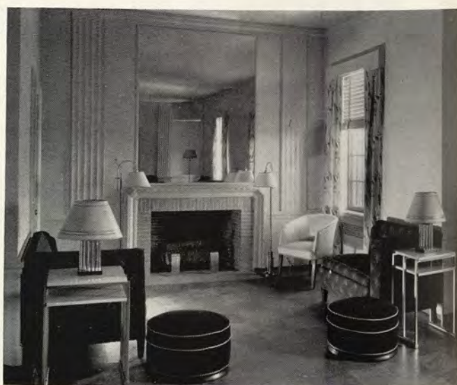
Taste in style of interiors changed as rapidly as taste in clothes and coiffures: Branford living room in 1926; Mary Harkness lounge in 1952.