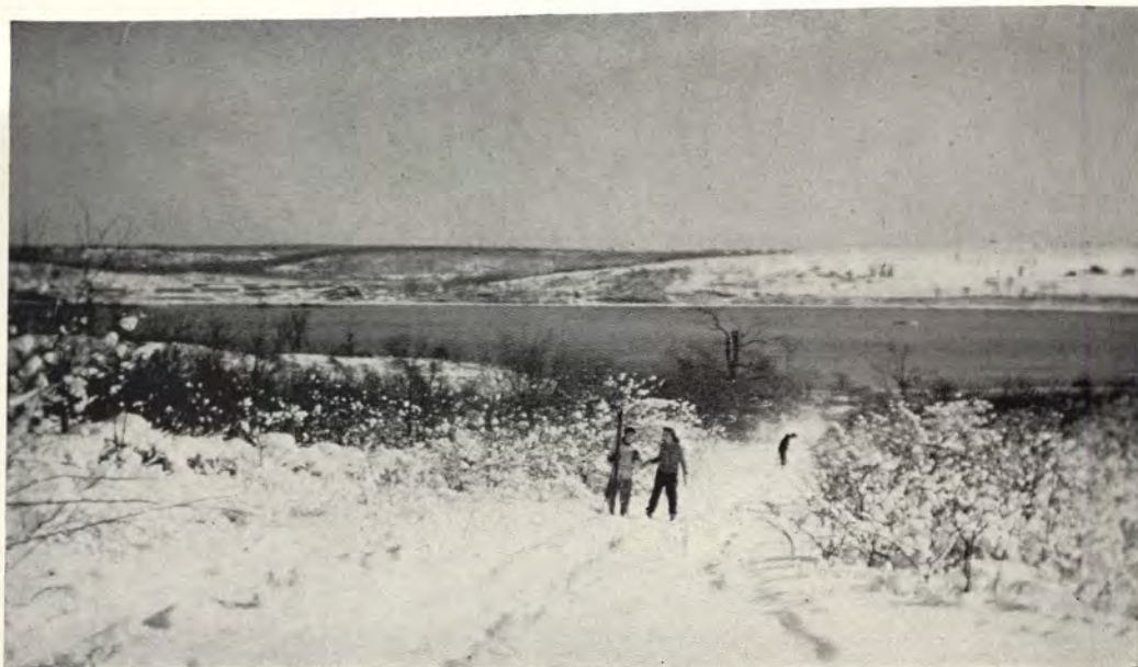
Outdoor recreation, never a problem at Connecticut.

As a goal it answered the requirements—it was needed, it was worthy, and it was significant—and it had a timelessness and all embracing quality that appealed to us. It would be of use to the student from the day she entered as an undergraduate and continue so for the rest of her life. It was a project in which students and alumnae could have a joint and equal interest. It symbolized the wide range of interests and activities of the college from the earliest days in an unbroken chain as far into the future as one could think. And to paraphrase a line recently made famous, "Old students don't just fade away, they become alumnae," and the building would symbolize this continuity of relationship to the college and its welfare, and so be worthy of honoring the memory of that vital, stimulating, scholarly man who was its first president.