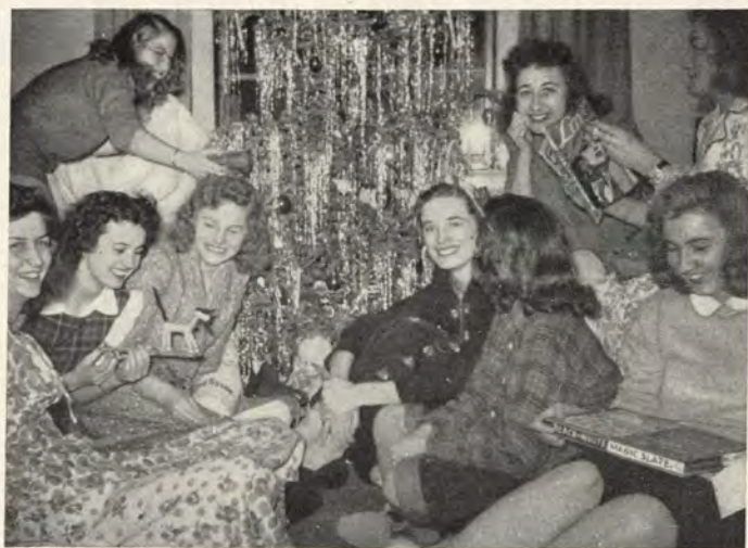
Dorm life. It never changes, though the seasons do.

There is, it seems to me, a certain snobbery in speaking of a "younger generation," or of an "older generation," or in any attempt to set aside and analyze groups undefinable by age limits imposed upon them. There is nothing more exasperating, for your own sake or for your friends', than to be told you are a toothpaste blob in a completely cautious generation, or an irresponsible bull-dozer in a completely self-centered generation, or a soulless record-changer in a completely pseudo-intellectual generation. I grant that all these states of character exist, but I consider none of them predominant, and when they are found, they cannot be confined to one so-called generation, but apply to the whole contemporary age.