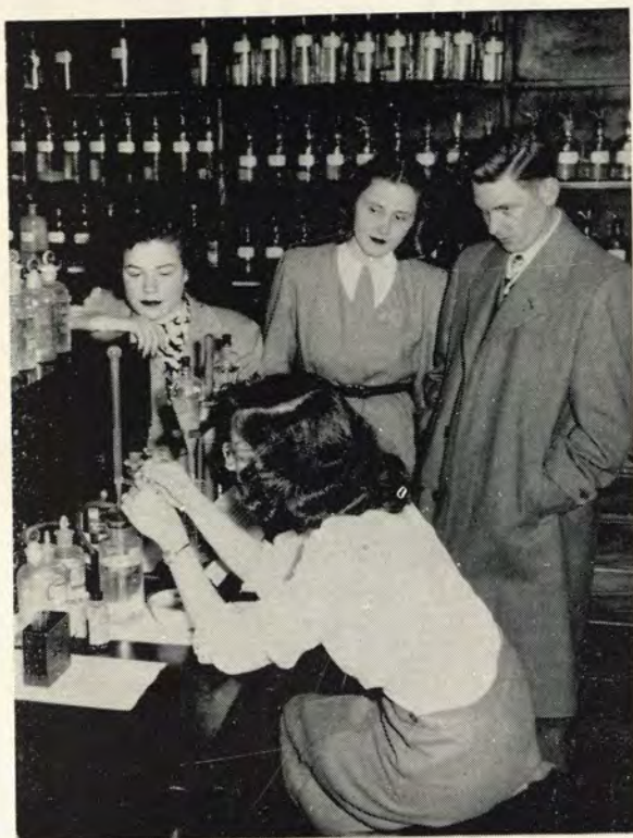
Intellectual pursuits: student science conference.

guilt that went with it were assuaged by the amount of punishment it could absorb. The young won personal fulfillment on their own terms or they were overpowered. Today so many of the barriers to personal fulfillments are down for the privileged young that it is hard for them to know when the terms are their own and when they aren't. But let us give credit where credit is due. Parental leniency, which began with the collapse of moral values and the demise of the paternalistic family, has been guided by psychiatry and scientific research such as Gesell's into a permissive attitude toward children. Parents no longer regard their offspring as miniature adults who must be safeguarded against evil impulses. Science has brought us a long way in our understanding of children. Today's teenagers are emancipated, and one of the abiding benefits is the good feeling they have for their parents. To the extent that they have been loved and led, rather than repressed and reared, the time-honored pattern of adolescent rebellion against the family has been tempered, and the process of modification is not yet complete. Mine is the most self-consciously permissive generation of parents, and we do well to look to the teenagers to gain insight into the influences that bear upon our own youngsters.