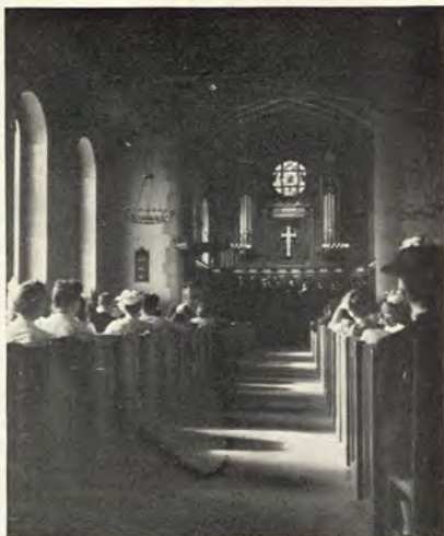
Service in Harkness Chapel.

The BOSTON Club exercised its fund-raising ingenuity this year by the sponsorship of "a night at the Brattle Theater" in Cambridge. In the past they have sponsored