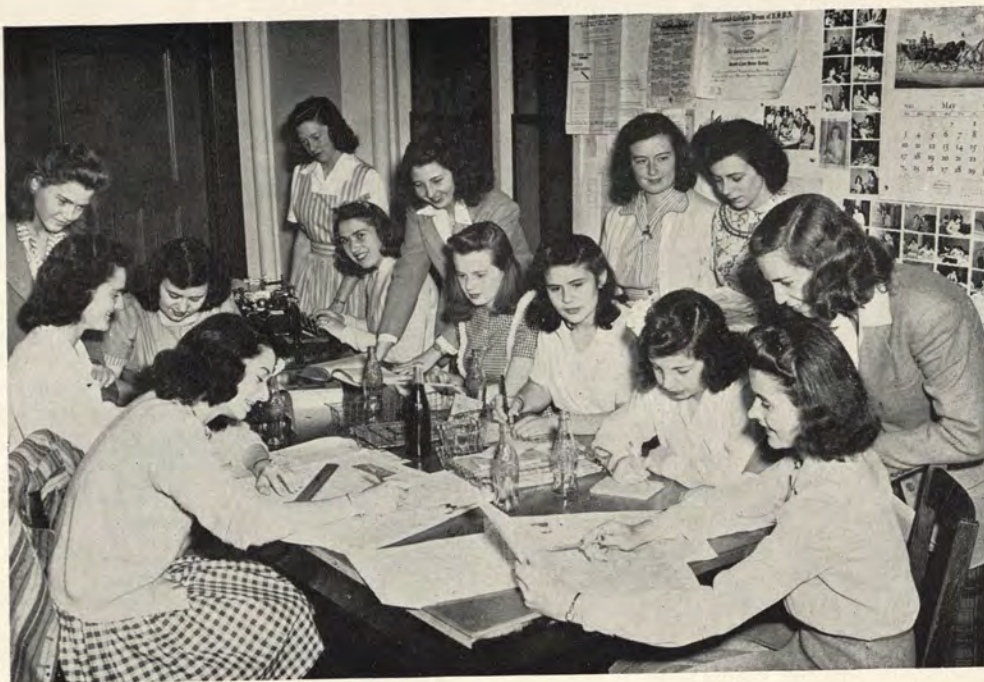
Outside interests: working on student publications.

say they are looking for it and are irritated and unhappy when, as mostly happens, they don't find it. They are much more aware than I was, certainly, that the information they collect in Psych. I bears no relation to the paper they are doing for English 42, and neither has the remotest connection with Economics 2 B. Whether they are always clearly aware of it or not, a basic unity is what they want and they don't want to stop with college. What happens in college must be, or ought to be, integrated with what is going on in the world outside. One should not, as one college sophomore recently put it, "have to stop living to prepare to live."