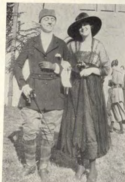
"Rich but not gaudy"

Had scandal party and midnight feed of scrambled eggs, coffee, and fudge yesterday night in the dorm. It was more fun! Argued about the best kind of marcel wave and whether rouge spots should be high or low or round or triangular and whether Herbert Hoover will win.