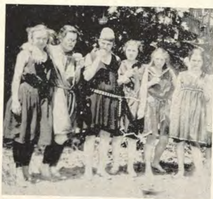
"By the Sea"

At freshman-junior party I witnessed Friday eve in the gym the marriage of Miss Molasses Ginger Bread to Mr. Devil's Food. Viewed wedding presents—everything from a glass auto to a turnip—and devoured wedding feast of gingerbread and milk.