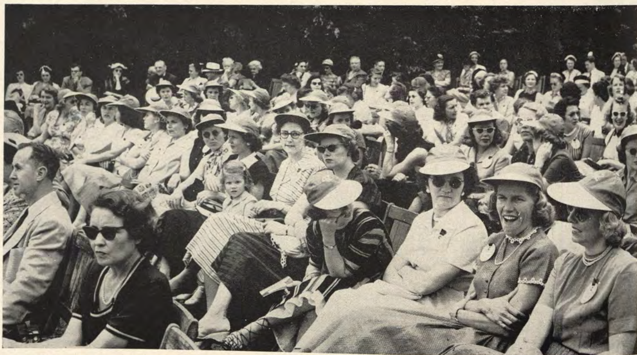
Return to campus of class and College friends plus perfect weather made '52 Reunion gala event for '42, '43, '44, '45.