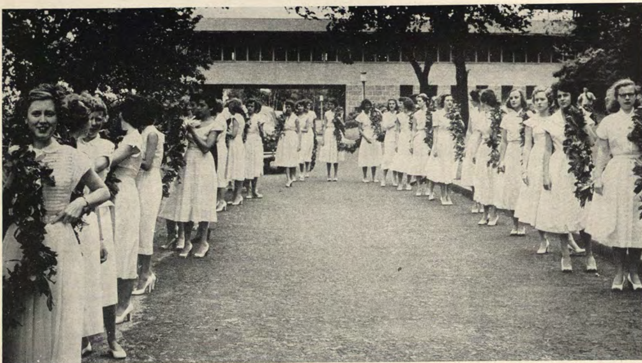
Members of '53 wait with Laurel Chain as Seniors gather for Procession