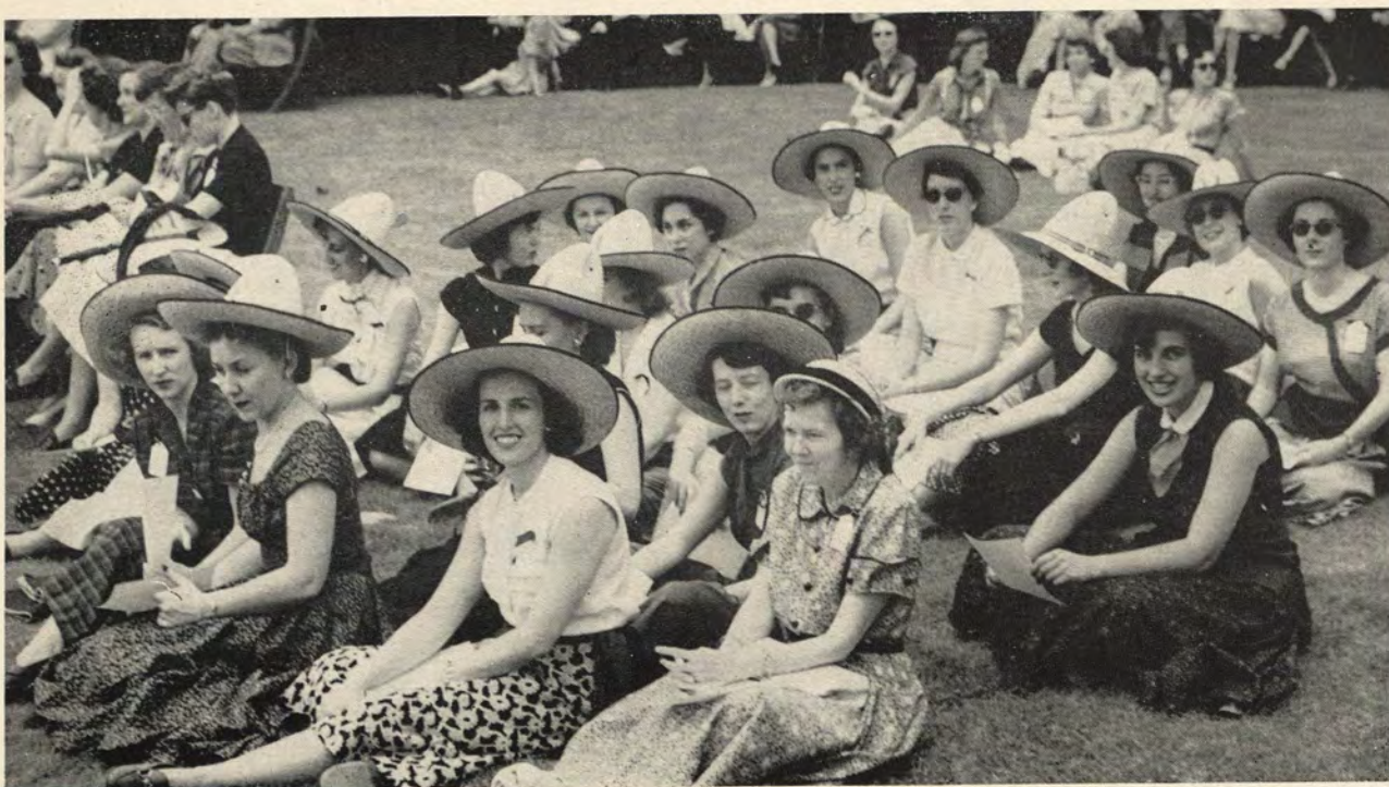
The sun was hot, but members of '51, grateful for their sombreros, looked daisy fresh.