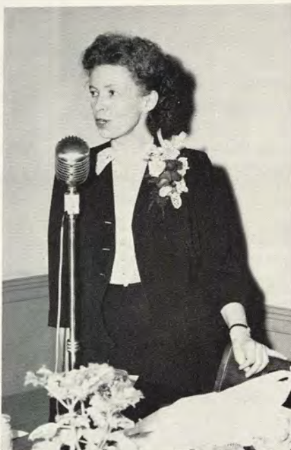
Miss Park at Alumnae Council.