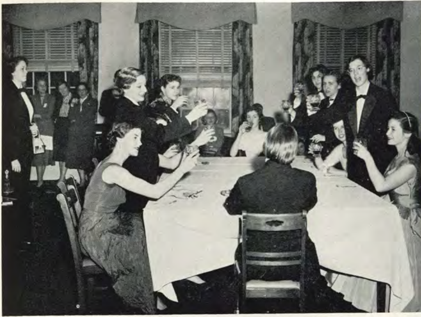
Wig and Candle presents "Shall We Join the Ladies?" for Alumnae Councilors.

money-raising, alumnae assistance in admissions, et cetera, to improve the quality of alumnae assistance to the different colleges, and to offer a central organization through which college officials may speak to larger groups than would be possible for one alumnae club of one college to interest or handle.