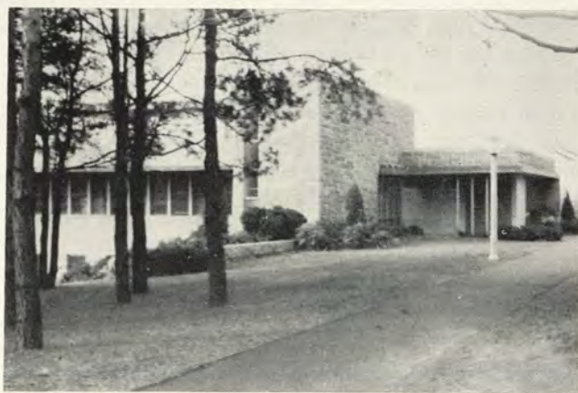
The Infirmary, South View

But we do not regard this special area of concentrated study as all-important; we want the student to realize that however independent of all other areas it may seem to be in our study of it, it is after all only part of a larger universe, that universe about which she should ultimately do considerable thinking. For this purpose, the general requirement of the major is set up, and this in turn has been changed slightly to bring it into closer relationship to the new College curriculum.