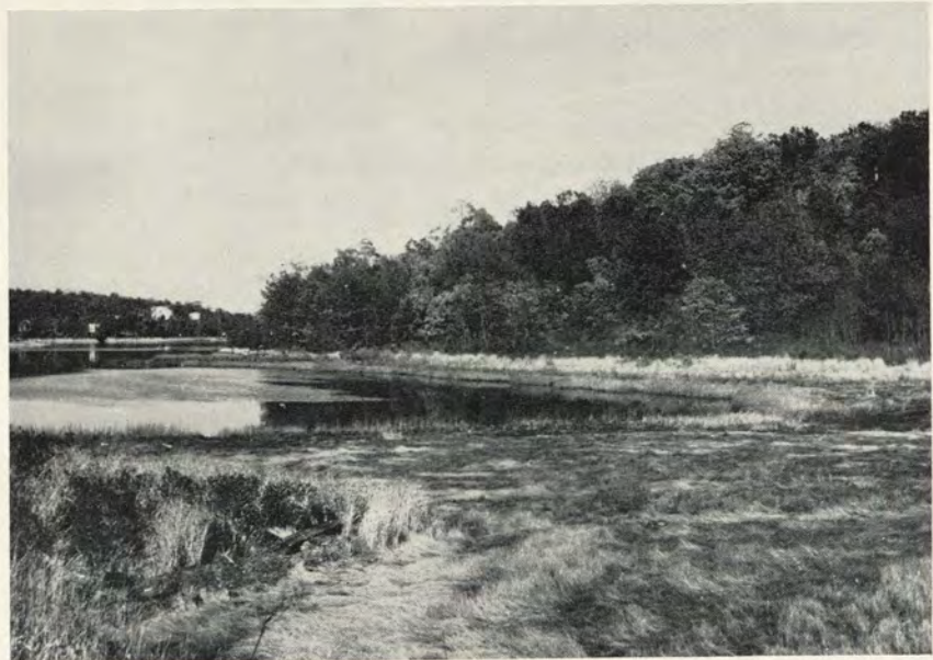
East View of Mamacoke Island.

Mr. Goodwin concludes successful drive for purchase and preservation of Mamacoke Island.