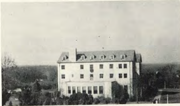
Kalbarine Blunt House

But with the establishment of certification requirements, the liberal arts colleges surrendered their heritage. They refused to meet the situation in the only way that was open to them which was to provide sufficient courses in education to enable their graduates to meet the requirements. Instead, they took the isolationist attitude of ignoring those requirements in their curricula; they preferred to regard themselves primarily as preparatory schools to the graduate schools of the universities. To such of their students as wished to be prepared to teach in the public primary or secondary schools, the liberal arts colleges advised them after graduation to go to the teachers colleges! The result is that today many fewer graduates of private liberal arts colleges are to be found in our public schools. There are happy exceptions, to be sure. But in general the liberal arts colleges severed their relationship with the public schools of this country. That it has been unfortunate for both can scarcely be doubted.