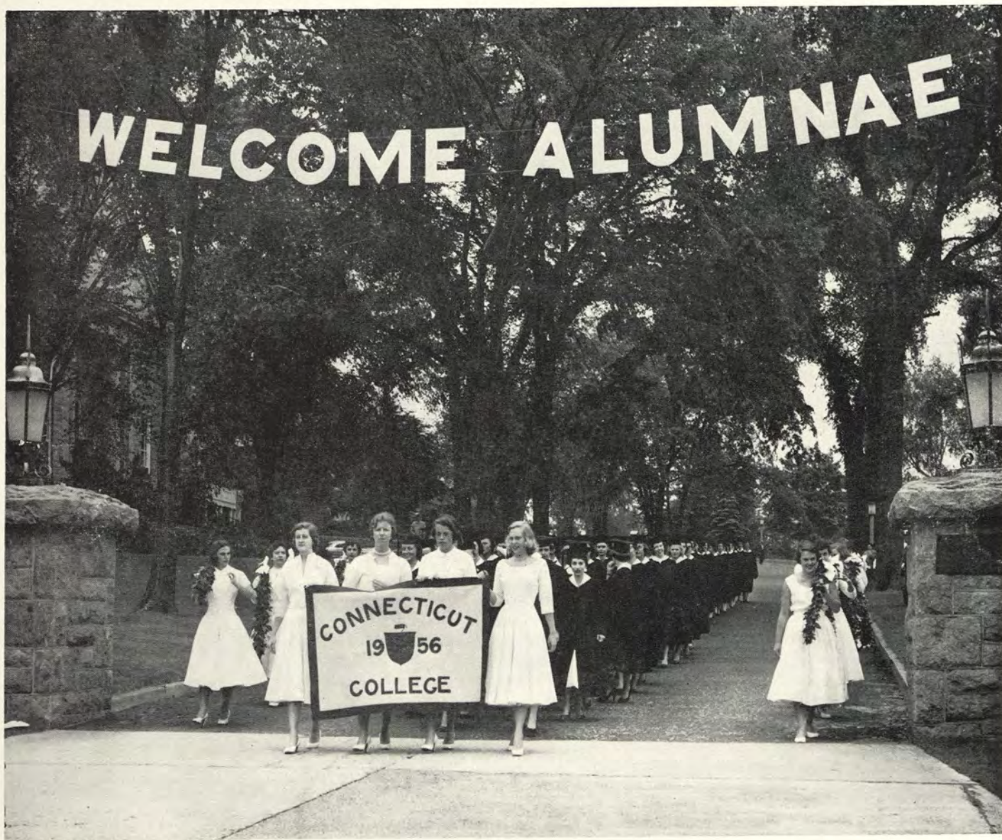
CLASS DAY PROCESSION