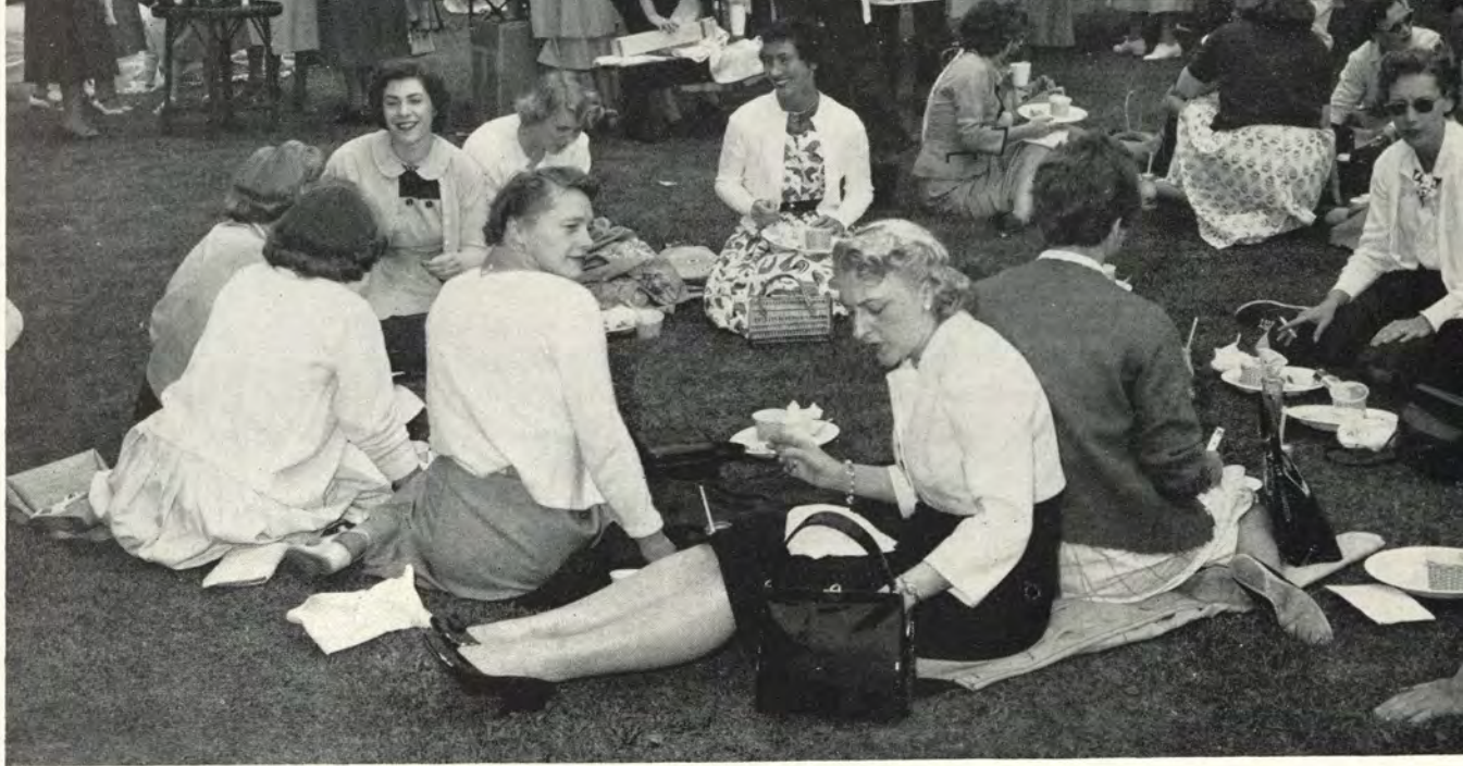
What's Class Day without the Trustees' Picnic?