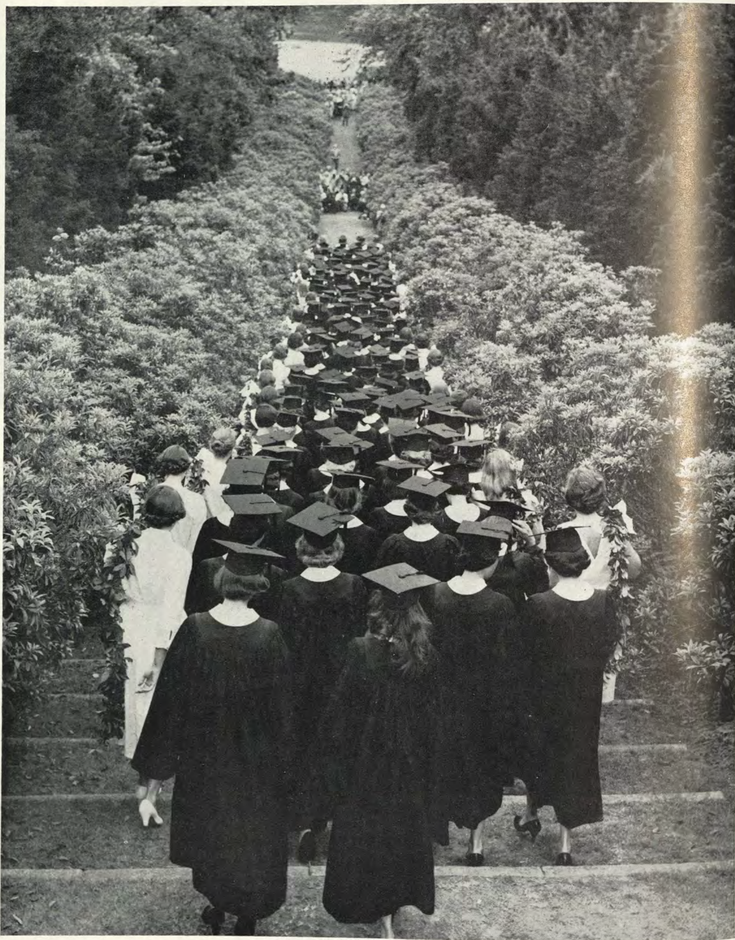
Class Day procession. Seniors march between Laurel Chain down Arboretum steps to Outdoor Theatre. Alumnae part of procession, in advance of Seniors, not shown in picture.