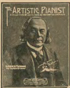
VLADIMIR DE PACHMANN